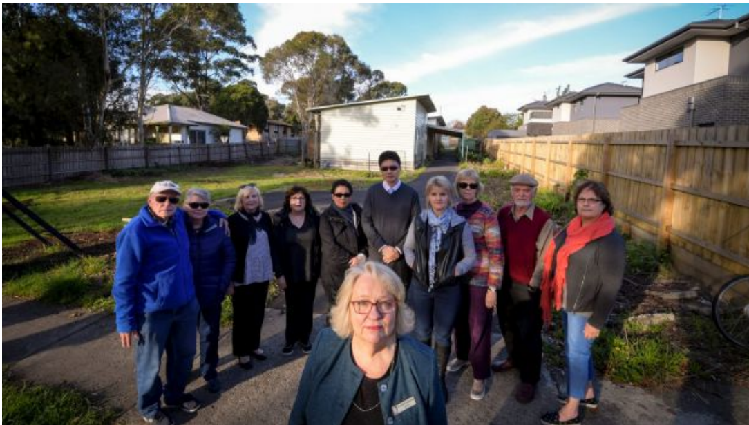
Whitehorse mayor Denise Massoud with residents angry about tree removal at a property in Blackburn South

"It's not illegal what they've done, but it certainly flies in the face of neighbourhood character and what the municipality stands for."