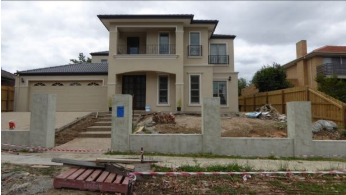
A moonscaped construction site in Burwood East.

The state government is facing growing pressure to act, after dozens of councils voted to demand increased fines for illegal tree removal at a recent state council meeting of the Municipal Association of Victoria.