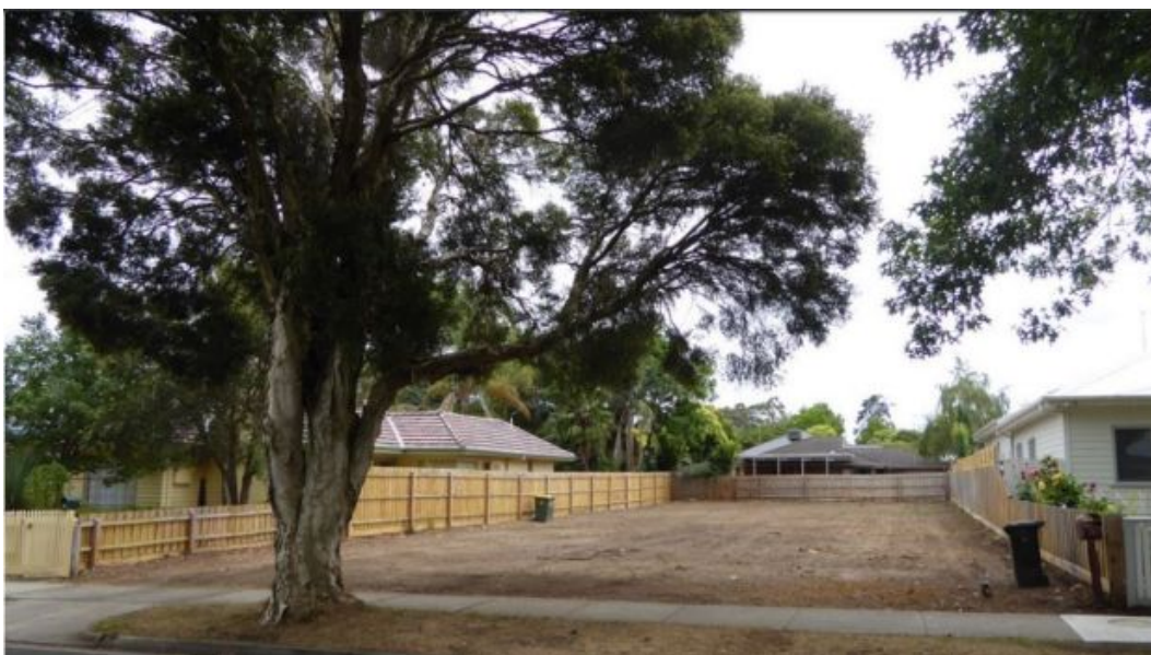
This site in Mitcham South has been stripped of all vegetation in preparation for development.

Arboriculture expert Greg Moore said only a small minority of arborists were willing to write flawed reports, but it did happen.