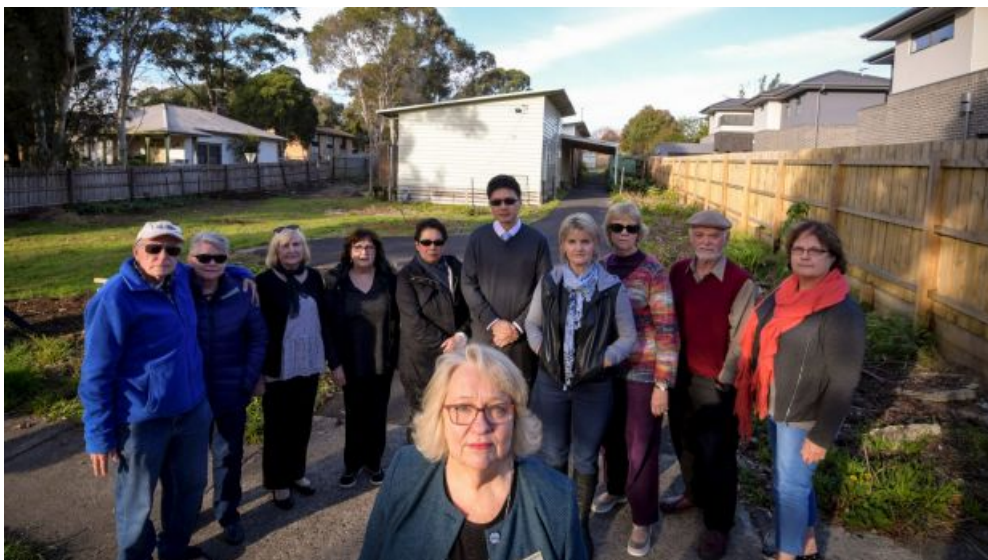
Whitehorse mayor Denise Massoud with residents angry about tree removal at a property in Blackburn South.

Concern about this behaviour and a trend of "moonscaping" (legally clearing blocks prior to development) has led a number of councils to call for stronger tree protection laws and penalties.